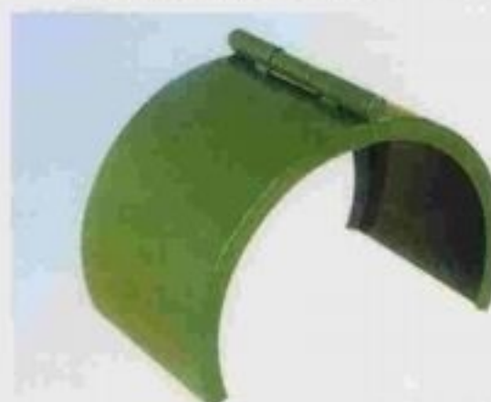
6. 夾頭蓋 Chuck guard