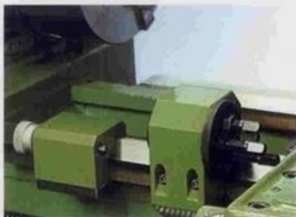
10. 微調裝置·四點定位裝置 Micro carriage stop, Turret carriage stop