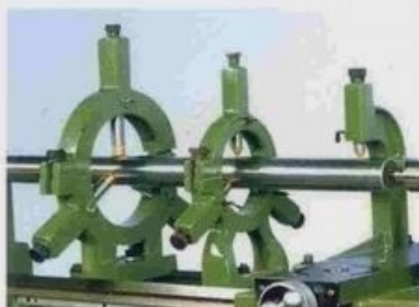
8. 跟刀架·中心架 Follow rest, steady rest