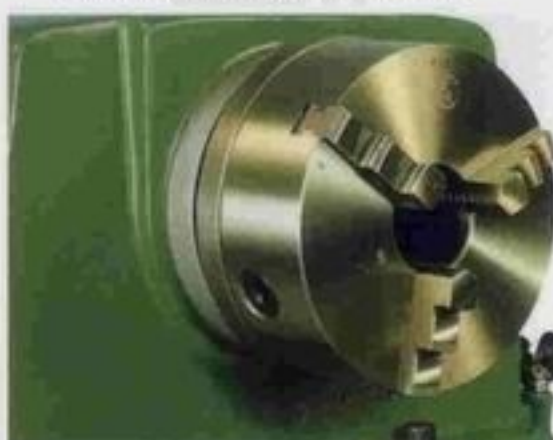
4. 普通三爪夾頭 3-Jaws scroll chuck