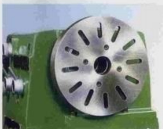
7. 花盤 Face plate