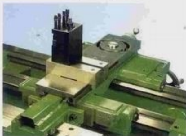
11. 後刀架·斜度附件 Rear toolpost Taper tuning attachment