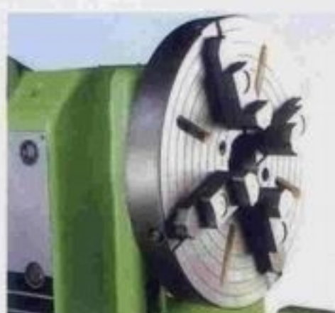
2. 四爪花盤 Face plate with 4-Jaws