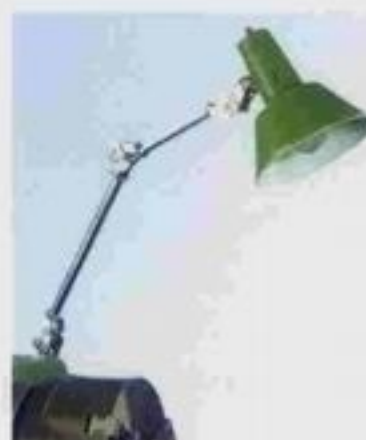
9. 工作燈 Work light