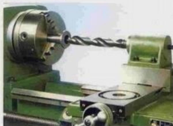
12. 鑽孔裝置 Drill attachment