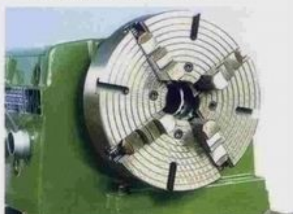
5. 四爪夾頭 4-Jaws ckuck