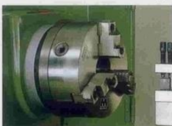
1. 強力三爪夾頭 3-Jaws strong scoll chuck