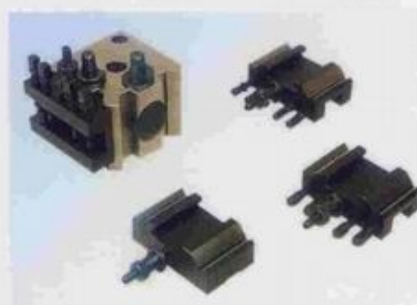
3. 快速變換刀架 Quick change toolpost